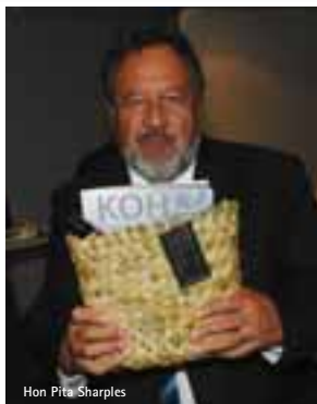
Hon Pita Sharples

A new online Māori business magazine was recently launched to make it easier for the world and Māori to do business.