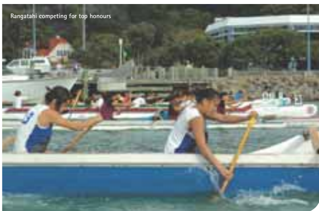
Rangatahi competing for top honours