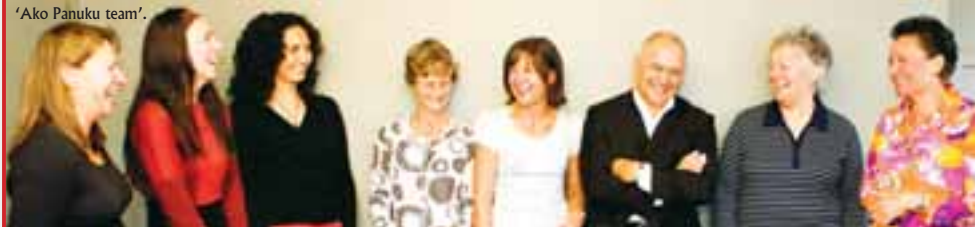
'Ako Panuku team'.

Practical strategies for raising Māori student achievement at school level and in the classroom. 3 x 2-day workshops and in school support.