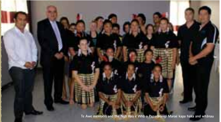
Te Awe members and the Nga Hau e Whā o Paparāangi Marae kapa haka and whānau

The Wellington Māori Business Network, Te Awe, recently hosted its annual charity golf classic, where they raised more than $10,000 for a Wellington-based marae.