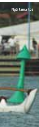
Ngā tama toa

"I congratulate the Trust for talking the talk and then walking the walk – ka mau kē te wehi."