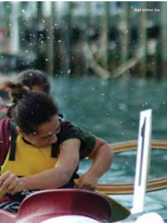
Ngā kohine toa