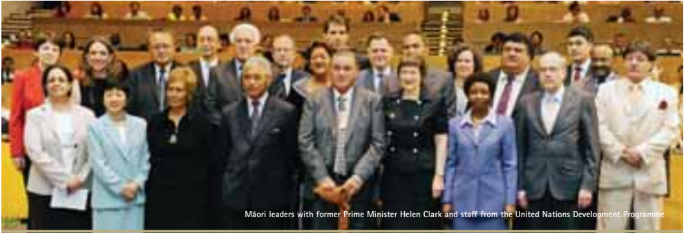
Māori leaders with former Prime Minister Helen Clark and staff from the United Nations Development Programme