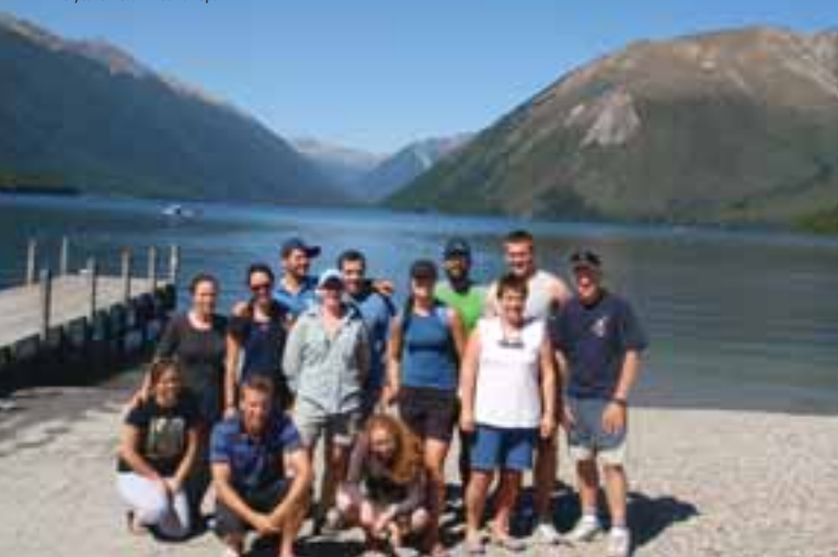
This year's Aoraki Bound rōpū

The programme, called Aoraki Bound, is run by Te Rūnanga o Ngāi Tahu with the support of Te Puni Kōkiri.