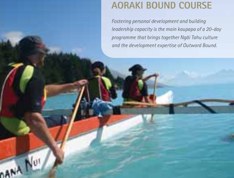
Hoe waka ama beneath Aoraki