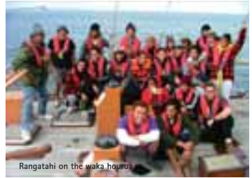
Rangatahi on the waka hourua

Once rangatahi have completed the trip, a presentation evening is held for their whānau, where the rangatahi share their experiences, skills, stories and how they will apply their learnings to their everyday lives.