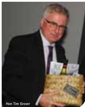
Hon Tim Groser

Koha magazine is a self-funded FOMANA Capital Ltd initiative that aims to promote high value added Māori businesses with a focus on the agri-business sector.