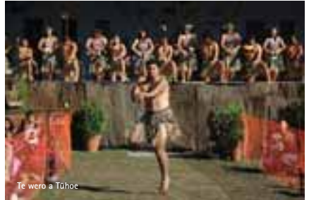
Te wero a Tūhoe