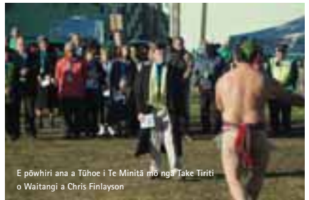
E pōwhiri ana a Tūhoe i Te Minitā mō ngā Take Tiriti o Waitangi a Chris Finlayson

ki tōna panekiretanga mā te whakapai i te whenua, te āwhina i te iwi, te manaaki i ngā rōpū, te whāngai i ngā kaumātua hoki.