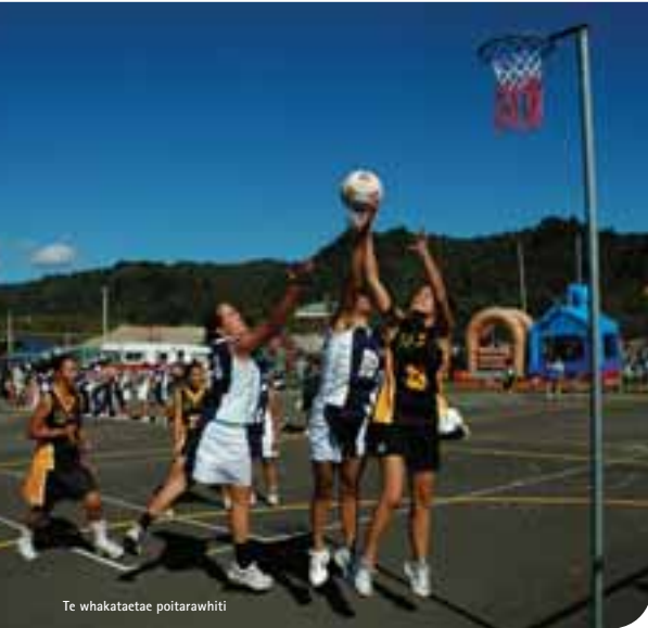
Te whakataetae poiārawhiti