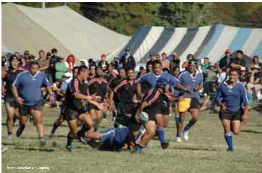
Te whakataetae whutupōro