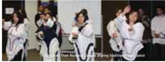
Rangatahi from Nunavut, Canada sharing traditional Inuit dance

Nunavut comprises one-fifth of Canada's land area, about the size of France and Spain combined with a population roughly that of Whanganui.