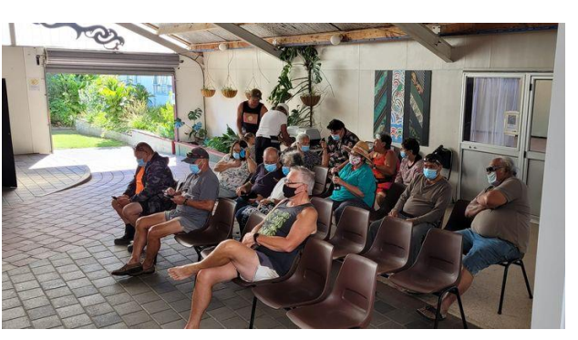
The Waimārama Marae Health Day supported by Nga Trust (Nannies against Photo Ngā Kairauhī Trust