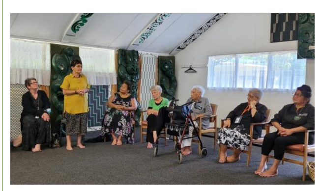
Nga Kairauhī Trust (Nannies against Covid) are being supported through MCCF with $0.245m to increase Māori vaccinations among their whānau, hapū and iwi.