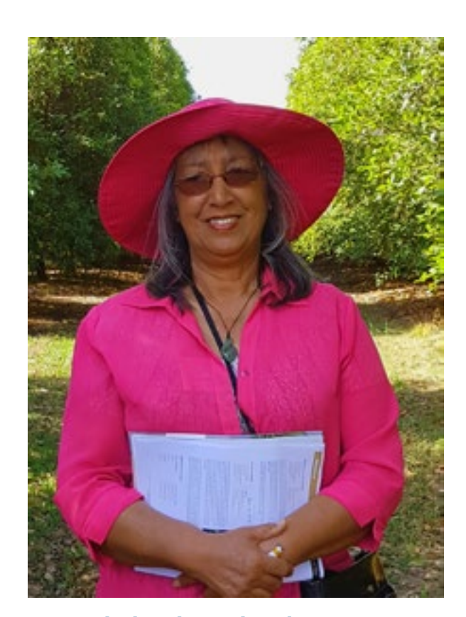
"NZTE helped me develop a comprehensive Investment Memorandum..."