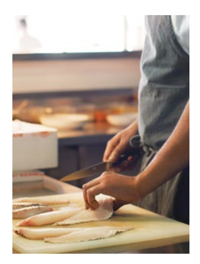
"Fishing has been and will always be a way of life for my family. It is simply what my family did."