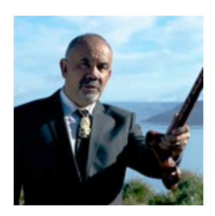
"E āku rahi, e āku nui, e āku rau rangatira mā, nei rā te mihi ki a koutou katoa."

Being in business isn't easy. It requires courage, risk, knowledge and money. It requires tenacity and a willingness to learn from others with experience, a clear plan and pathway to grow your business. It doesn't matter whether you are a small business, or big export business – the challenges are the same. You have to know your customer and design a product that they will pay for. You need access to expertise and mentors to help guide your business strategy, and partners with the right skills and assets who share your values and vision. You have to put skin in the game.