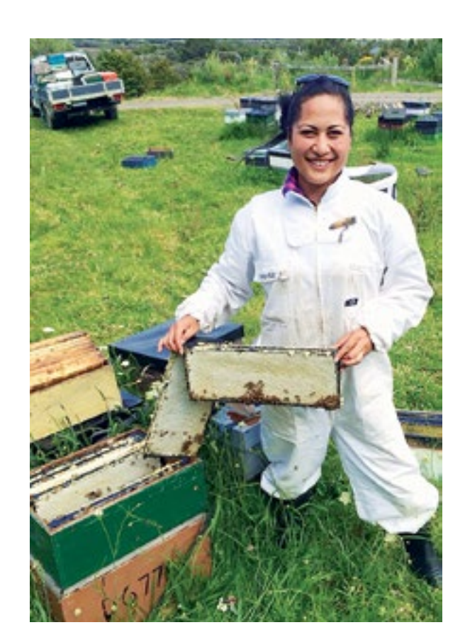
"It's such an amazing feeling to be able to harvest honey with my brothers and my sister..."