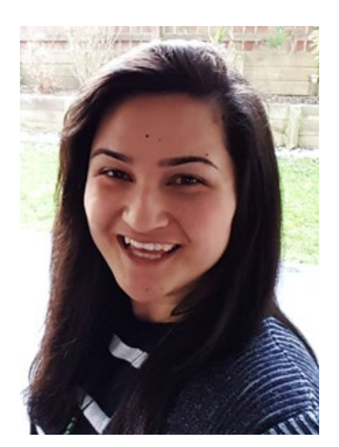
"I want to give my son the best life possible and the tech industry can help me do that."